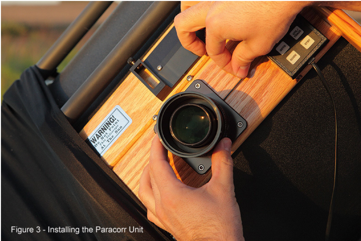
Figure 3 - Installing the Paracorr Unit