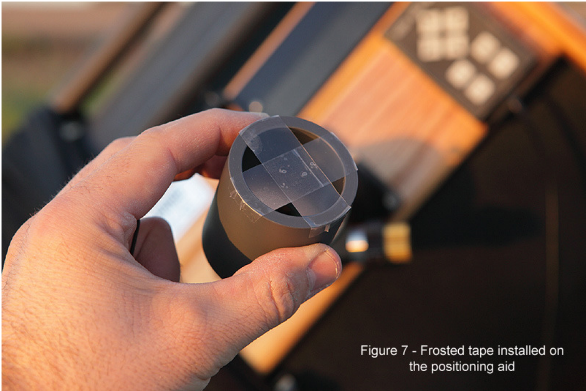
Figure 7 - Frosted tape installed on the positioning aid