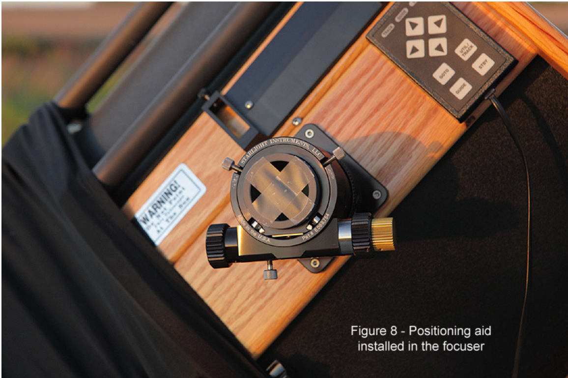
Figure 8 - Positioning aid installed in the focuser