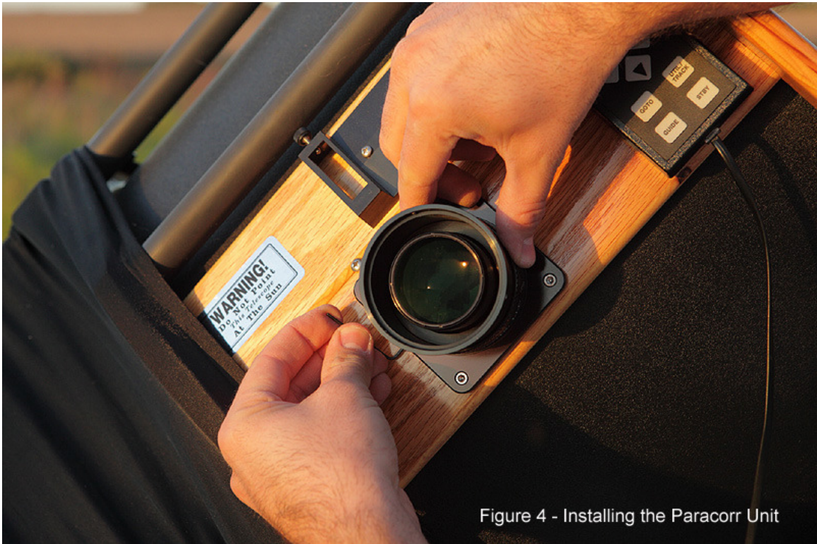
Figure 4 - Installing the Paracorr Unit