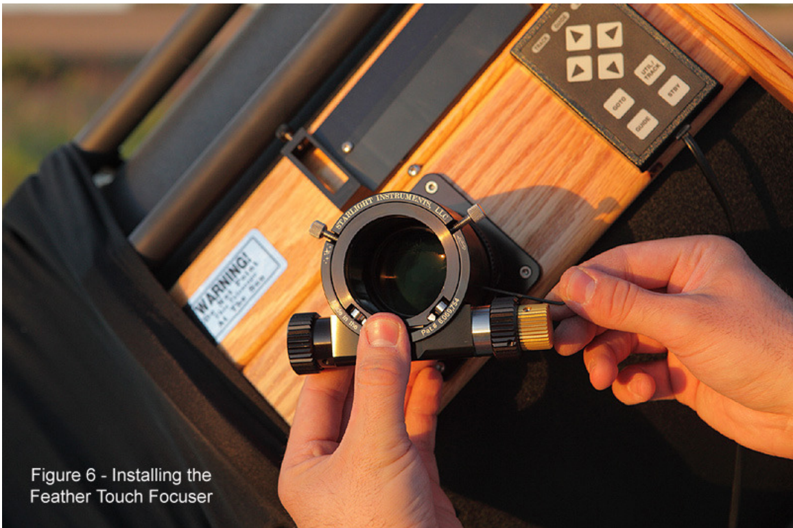
Figure 6 - Installing the Feather Touch Focuser